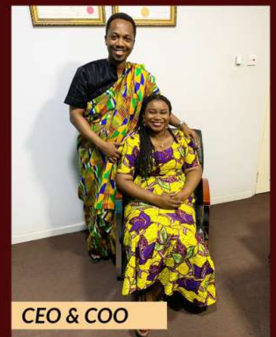
CEO & COO