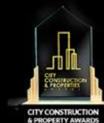
CITY CONSTRUCTION & PROPERTY AWARDS