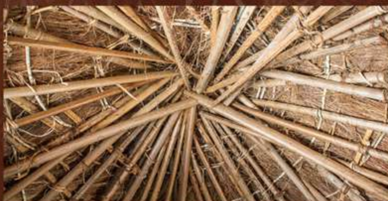
Typical Ceiling of A Mud Hut, Ghana