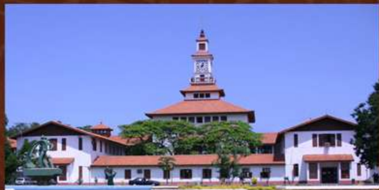
Balme Library, University of Ghana