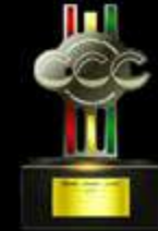
CHAMBER BUSINESS AWARD