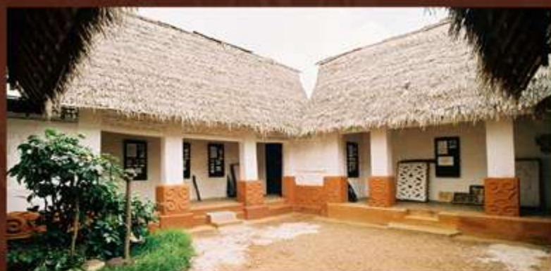
Besease Shrine, Ashanti Region