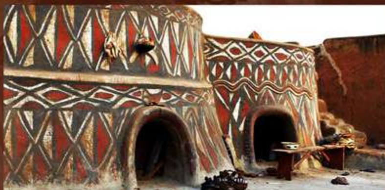
Sirigu Huts, Northern Region, Ghana