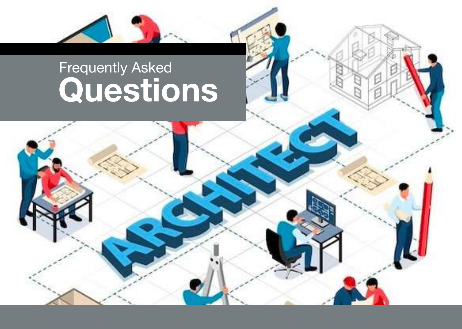
How long does it typically take to build a house with Spektra Global?